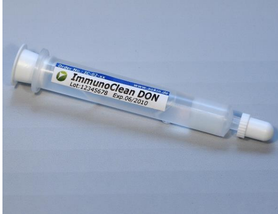
aokinImmunoClean C DON column