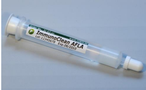
aokinImmunoClean C AFLA column

Order no.: IC-C-03-25 Lot: xxx xxx xxx xxx