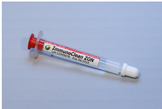
aokinImmunoClean CF ZON column

Order no.: IC-CF-01-25 Lot: xxx xxx xxx xxx