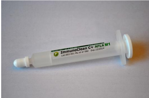
aokinImmunoClean C+ AFLA M1 column

Order no.: IC-C+-31-25 Lot: xxx xxx xxx xxx