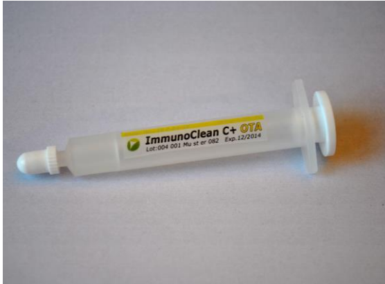
aokinImmunoClean C+ OTA column