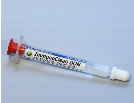
aokinImmunoClean CF DON column

Order no.: IC-CF-02 Lot: xxx xxx xxx xxx