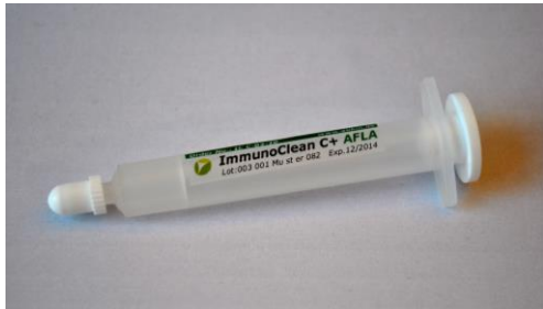
aokinImmunoClean C+ AFLA column

Order no.: IC-C+-03-25 Lot: xxx xxx xxx xxx