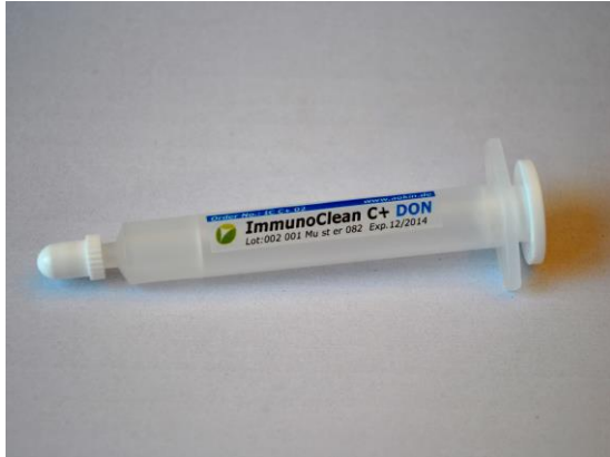
aokinImmunoClean C+ DON column