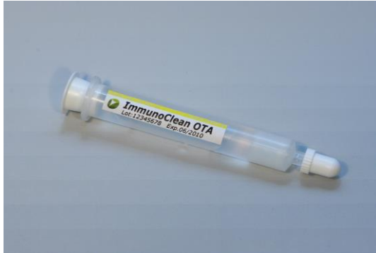
aokinImmunoClean C OTA column

Order no.: IC-C-04-25 Lot: xxx xxx xxx xxx