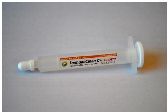
aokinImmunoClean C+ T2/HT2 column

Order no.: IC-C+-78-25 Lot: XXX XXX XXX XXX