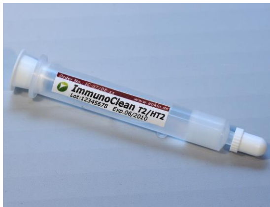
aokinImmunoClean C T2/HT2 column

Order no.: IC-C-78-25 Lot: xxx xxx xxx xxx