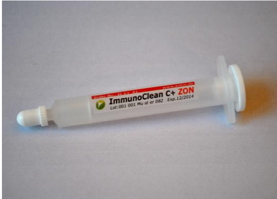
aokinImmunoClean C+ ZON column

Order no.: IC-C+-01-25 Lot: xxx xxx xxx xxx