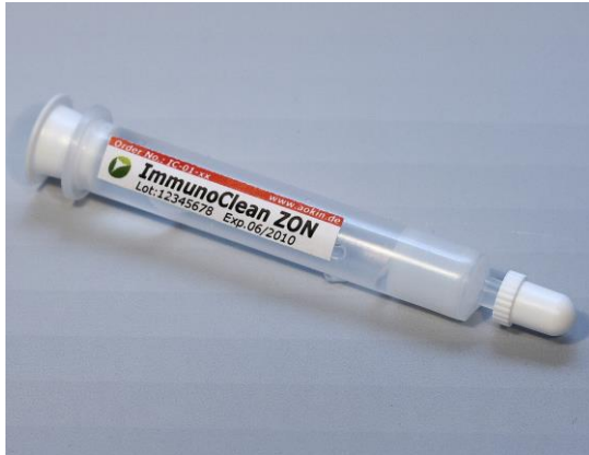
aokinImmunoClean C ZON column