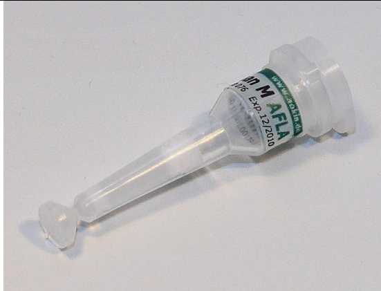
aokinImmunoClean M AFLA M1 column